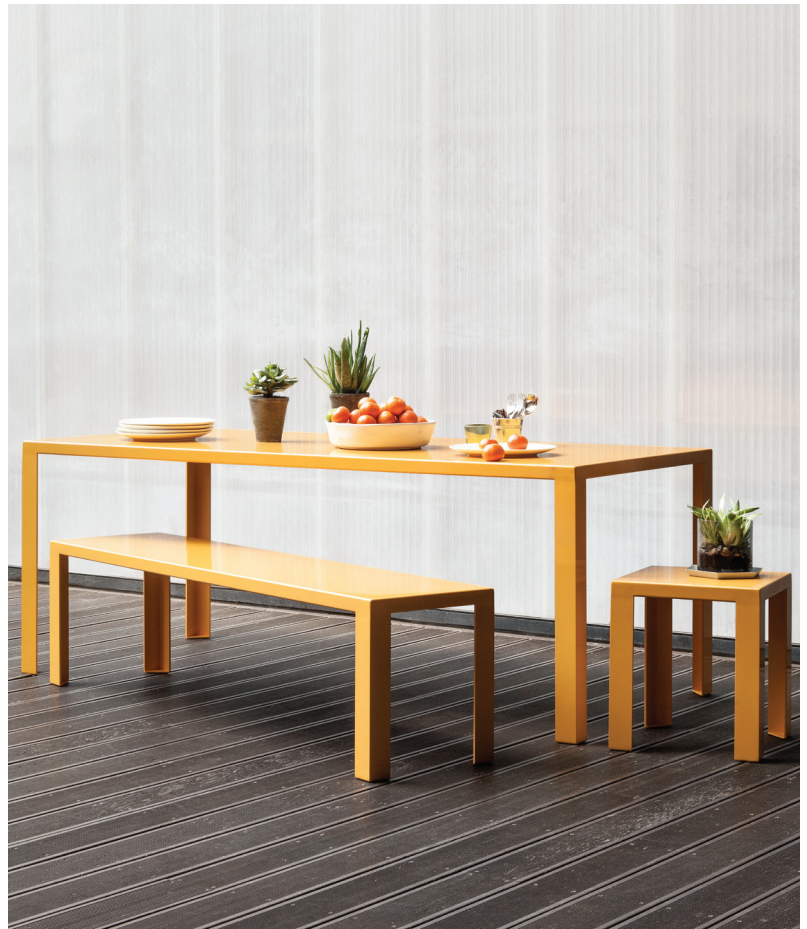
Powder-coated aluminium (colour Saffron Yellow RAL 1017)