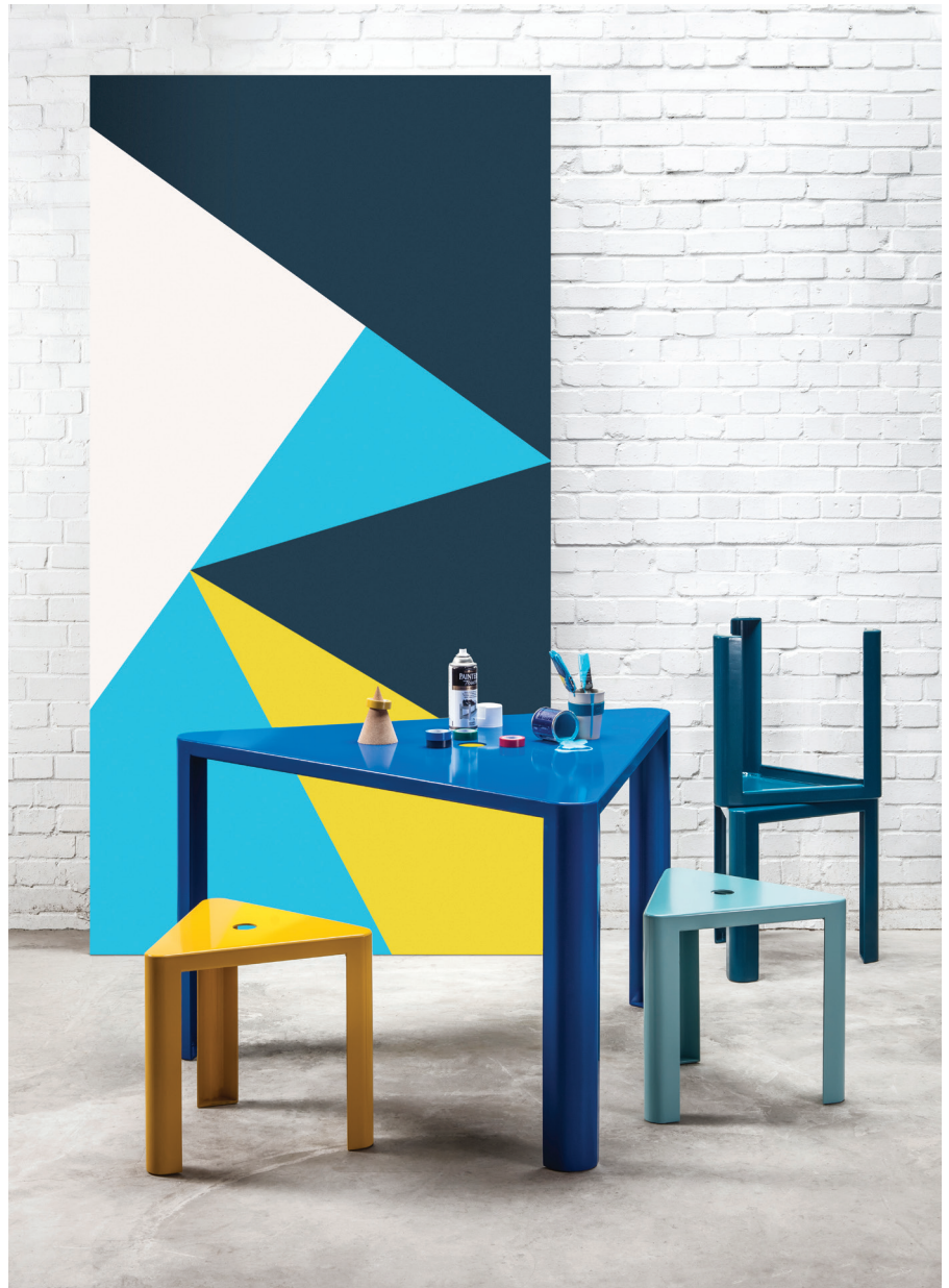
Product shown in colour : Traffic Blue RAL 5017

Check on access to ensure this one piece product can be installed without difficulty.