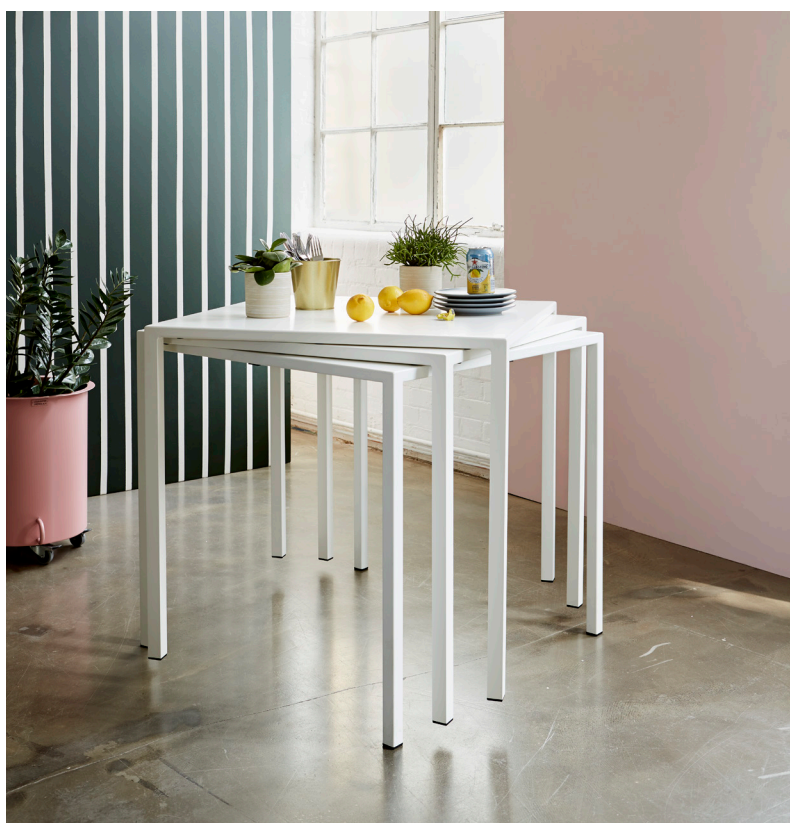
Powder-coated aluminium (colour White RAL 9010)

Check access to ensure this one piece product can be installed without difficulty.