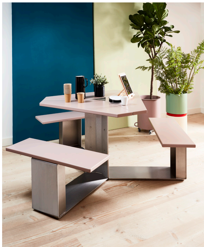
Powder-coated aluminium surface (colour Sable BS O4-B-21). Legs: Stainless steel