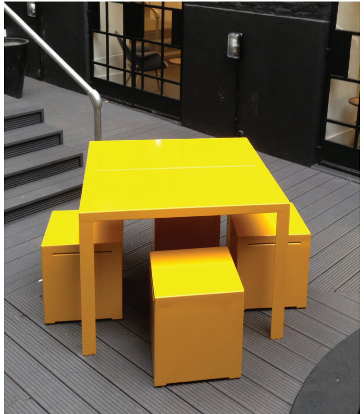
Powder-coated aluminium (colour Signal Yellow RAL 1003)