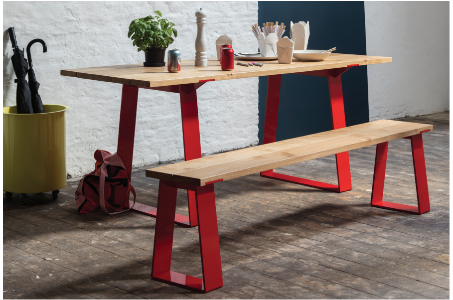
Product shown in colour : Traffic Red RAL 3020