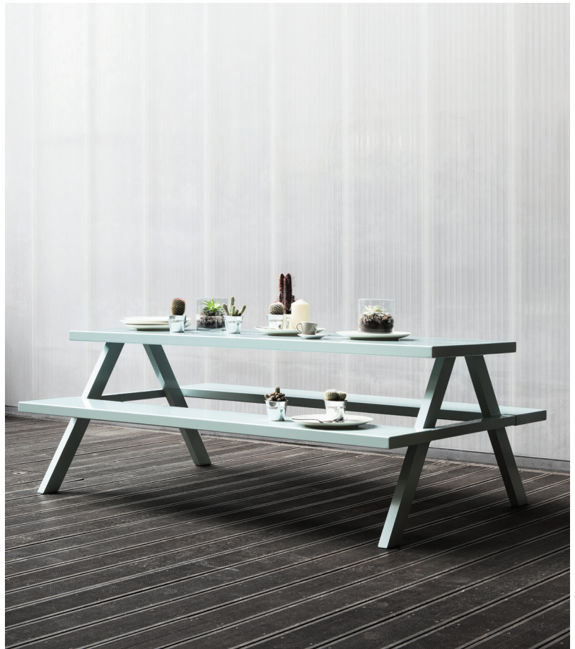
Powder-coated aluminium (colour Light Admiralty Grey BS 697)

Delivered assembled. Check access to ensure this one piece product can be installed without difficulty.