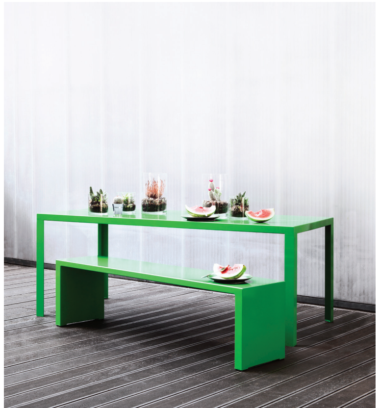
Powder-coated aluminium (colour Yellow Green RAL 6018)

Delivered assembled. Check access to ensure this one piece product can be installed without difficulty.