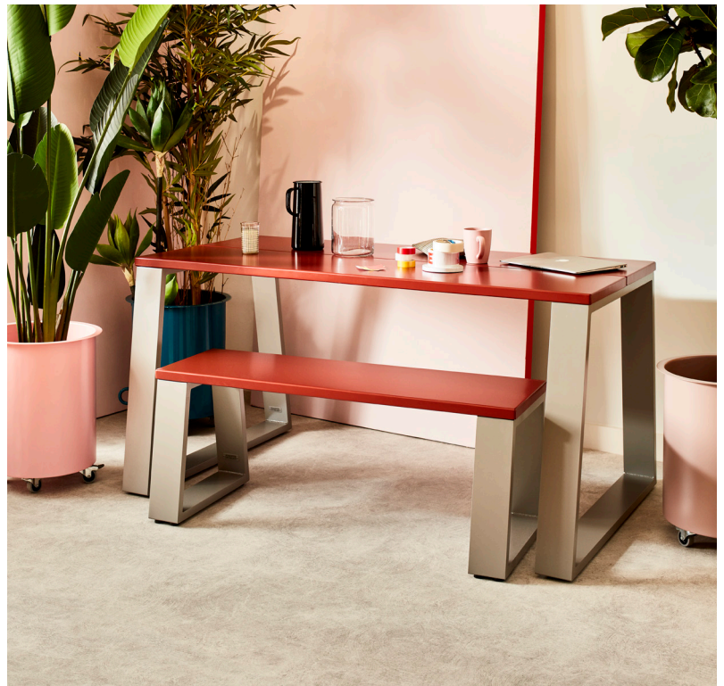
Powder-coated aluminium (surface colour Oxide Red RAL 3009, legs Gunmetal)