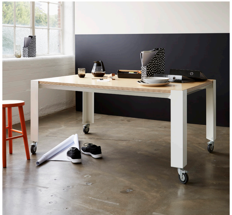
Birch ply surface. Aluminium legs powder-coated colour White RAL 9010.

Delivered disassembled. Full assembly instructions provided.